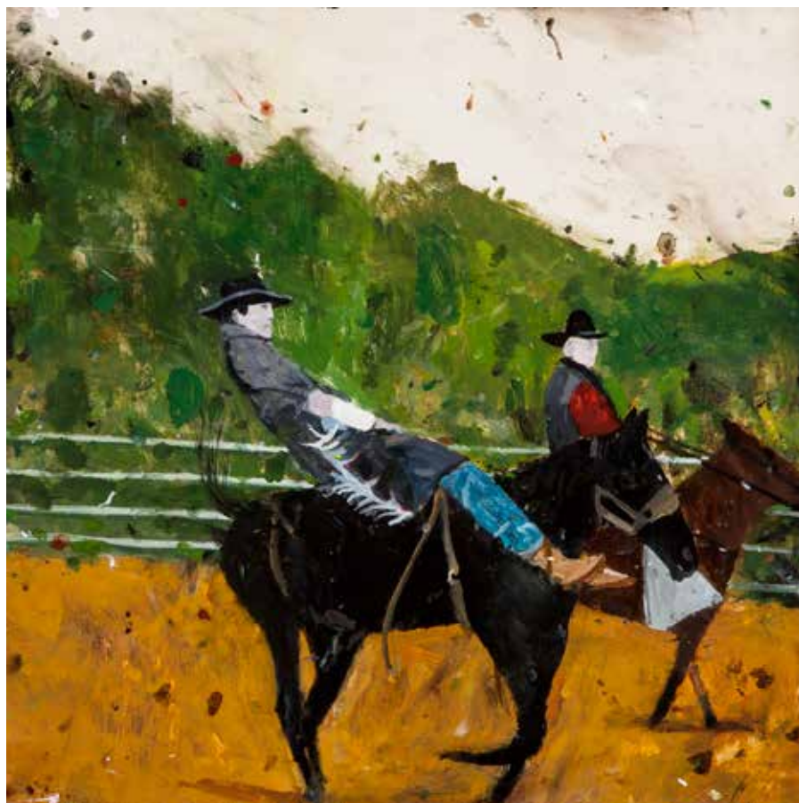
Bareback Champion Oil on epoxy coated steel 50 x 50 cm 2014