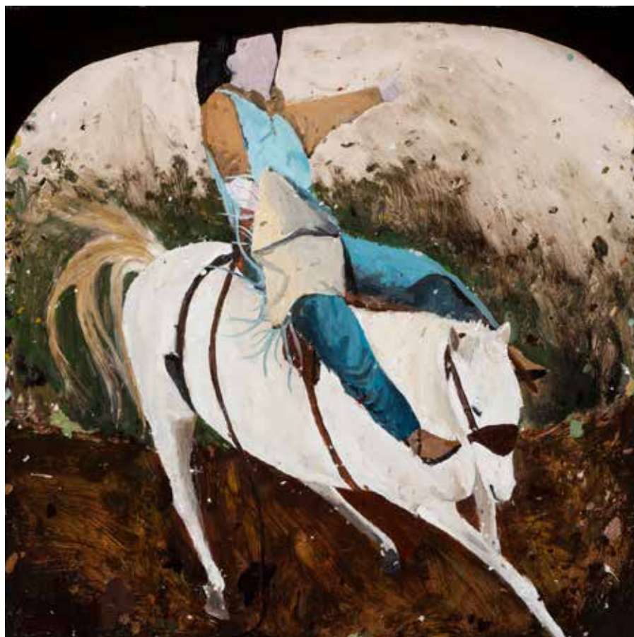
Saddle Bronc oil on epoxy coated steel 75 x 75 cm 2014