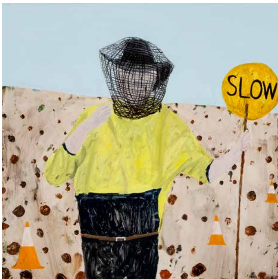
Slow oil on epoxy coated steel 75 x 75 cm 2014